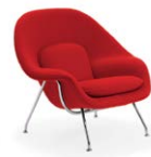
Child's Womb Chair 31"W x 28"D x 27¼"H