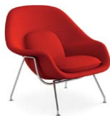
Medium Womb Chair 35"W x 31"D x 31¼"H