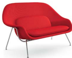
Womb Settee 62¾"W x 34"D x 35½"H