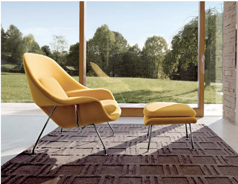
Womb settee arm detail (right) and Womb chair and ottoman (below)

through the shape of its shell, not the depth of its cushioning. The fiberglass design supports multiple sitting postures as well as a sense of enclosure. Designed in 1948, it remains one of the most iconic symbols of mid-century modern design.