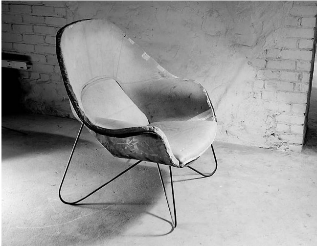
A prototype of the Womb Chair shell (left), Eero Saarinen sitting in the Womb Chair as intended (below)